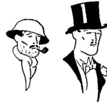
The chaps that looked a little tough—turned out to be gentlemen