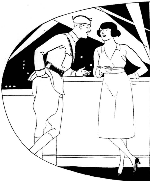
But there is one pleasant little trait in a soldier that never changes: one thing that is constant with him, the world over. And that is his eagerness to engage any girl, of any name, of any sort, in any country, at any time, in any language—in quite heated, not to say burning, conversation