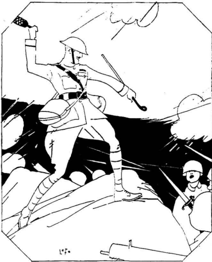
At the Front! O, how brave he was! Nothing frightened him—bayonets, bombs, smoke, shrapnel, hand grenades—nothing!